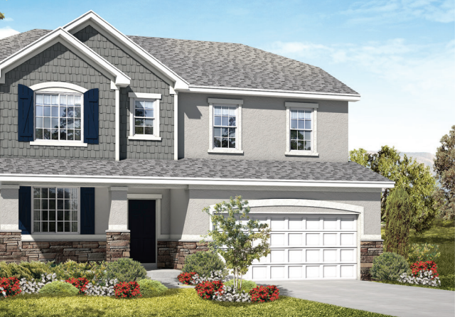
Approx. square feet: 2,450

Stories: 2 Bedrooms: 4 - 7 Garage: 2- to 3-car Plan Number: U250