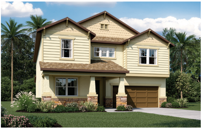
Elevation C - Shown with optional stone

True foyer. Spacious great room merging kitchen, dining and family entertainment area. One of a kind Master suite with oversized WIC. Additional Teen room space on second floor.