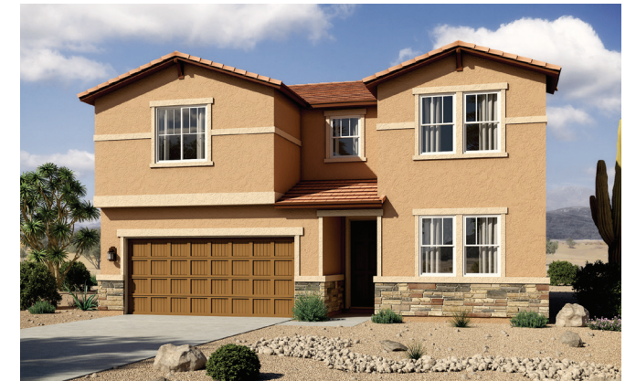
Elevation B Shown with optional stone