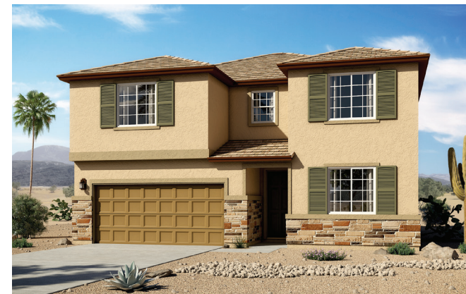
Elevation C Shown with optional stone