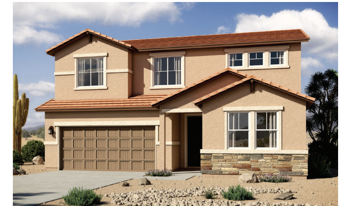
Elevation B Shown with optional stone