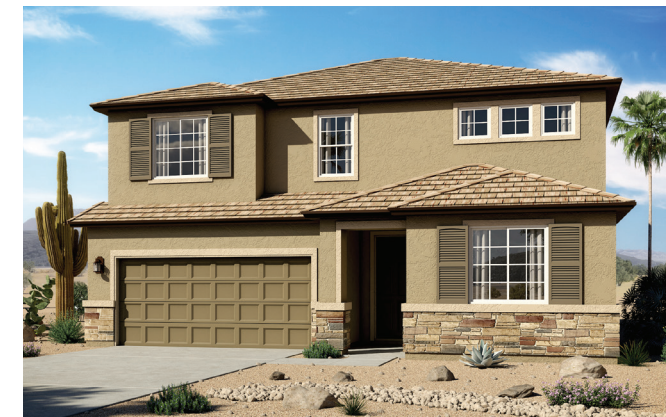
Elevation C Shown with optional stone