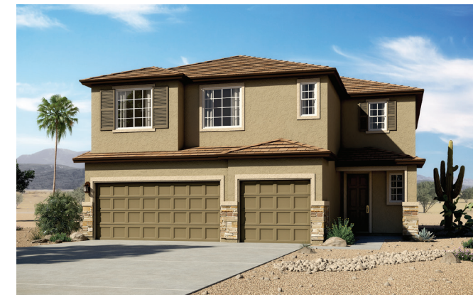
Elevation C shown with optional stone