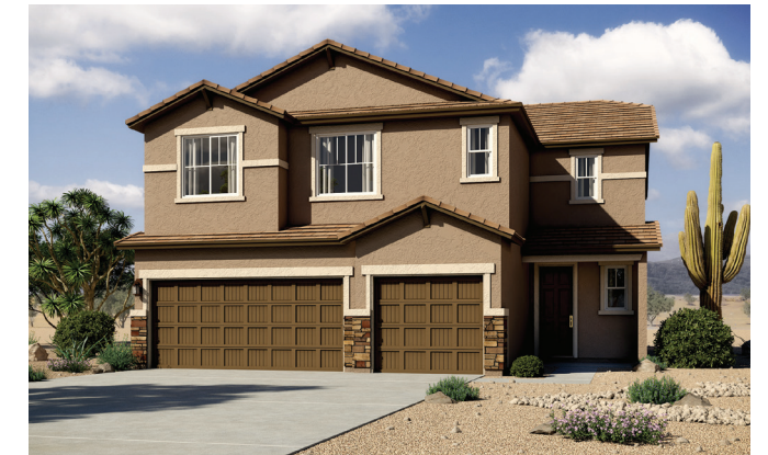
Elevation B shown with optional stone