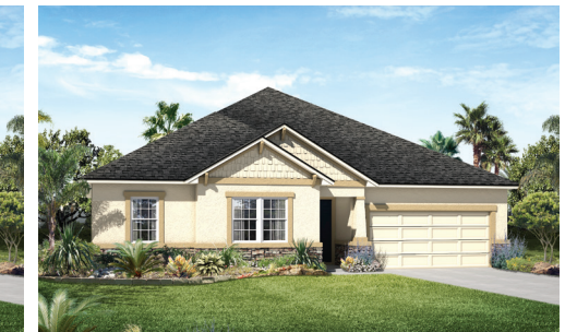
Elevation C - shown with optional stone