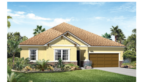
Elevation C - Shown w/ opt stone