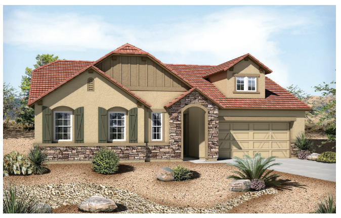
Elevation D - Shown with optional stone

HOME GALLERY 3091 West Ina Road Tucson, AZ 85741 877-346-8102