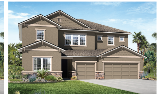
Elevation C - shown with opt. stone