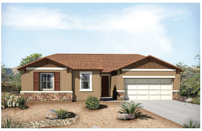
Elevation B - Shown with optional stone

This 3-bedroom ranch plan features a livable layout and stylish design options. Take advantage of extra storage space in the garage and an open teen room connecting the two front-facing bedrooms. And enjoy a private master bedroom, tucked away from the bustle of the common areas and connected to a deluxe master bath and walk-in closet.