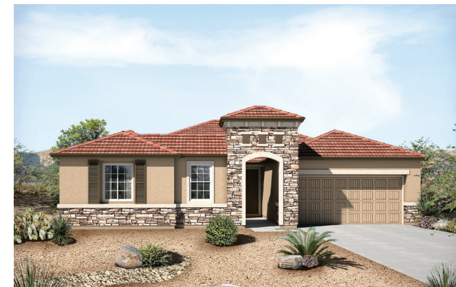
Elevation C - Shown with optional stone