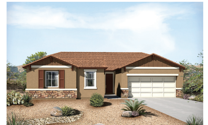
Elevation B - Shown with optional stone