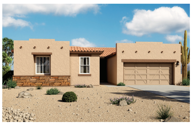
Elevation B shown with optional stone

The ranch-style Denise plan greets guests with a charming courtyard entry. Once inside, you'll appreciate the great room with optional fireplace and the inviting kitchen with maple cabinets, granite countertops and optional gourmet features. You'll also enjoy the quiet study, which can be optioned as an additional bedroom, and the relaxing covered patio with optional multi-slide doors. Other highlights include a bonus room and a luxurious master suite with an expansive walk-in closet.