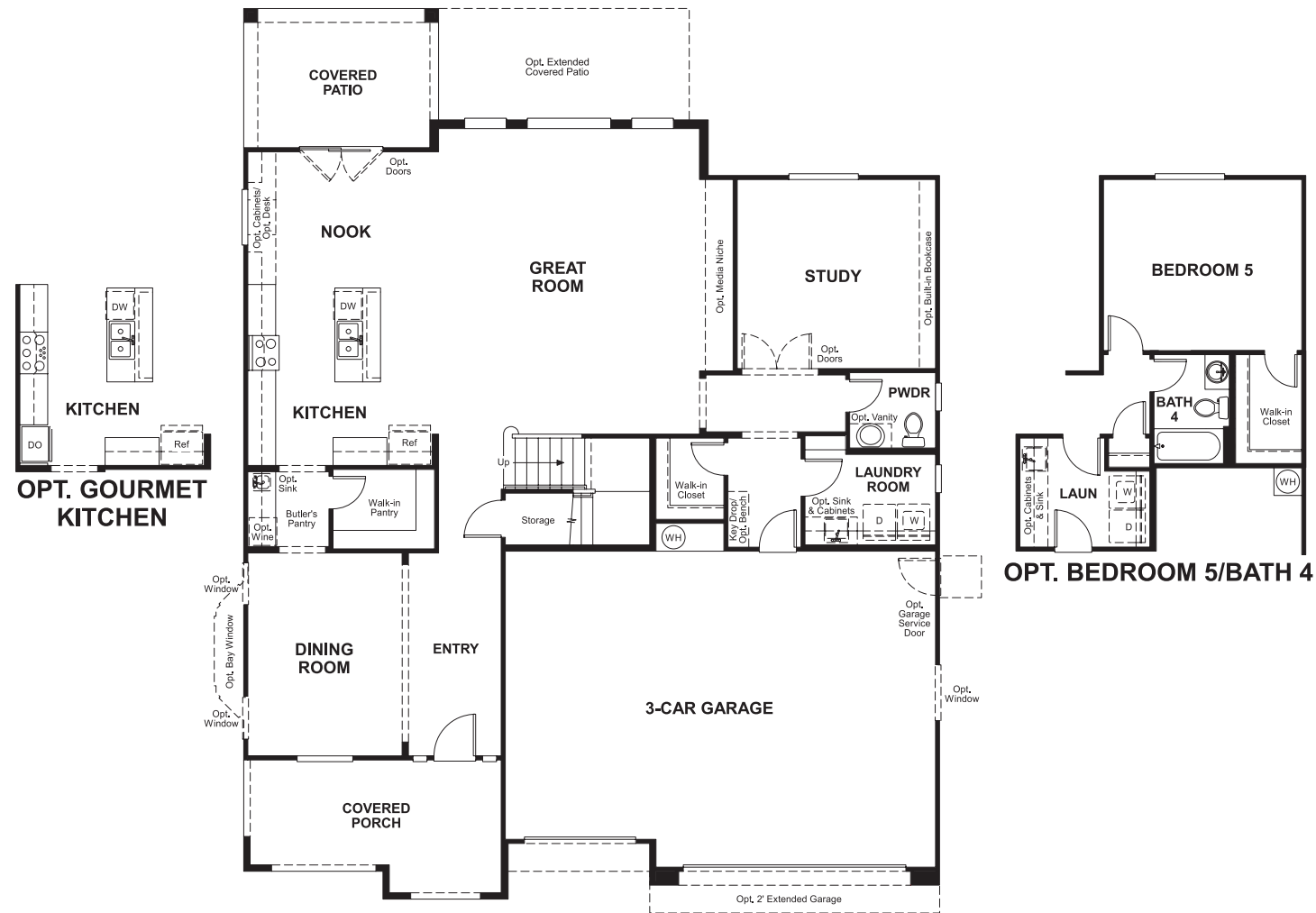
OPT. BEDROOM 5/BATH 4