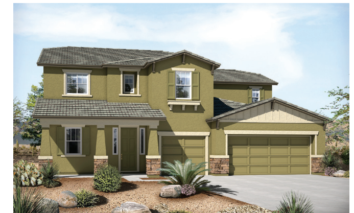
Elevation B - Shown with optional stone