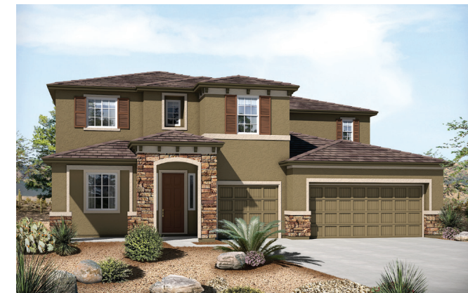
Elevation C - Shown with optional stone