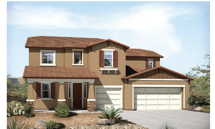
Elevation B - Shown with optional stone