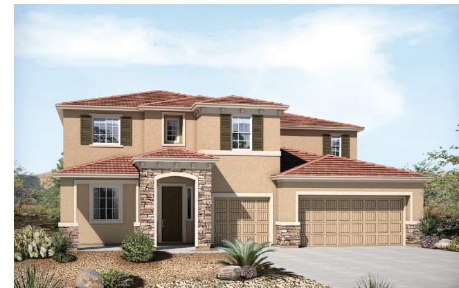
Elevation C - Shown with optional stone