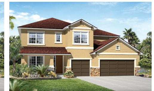
Elevation C - Shown w/ optional stone