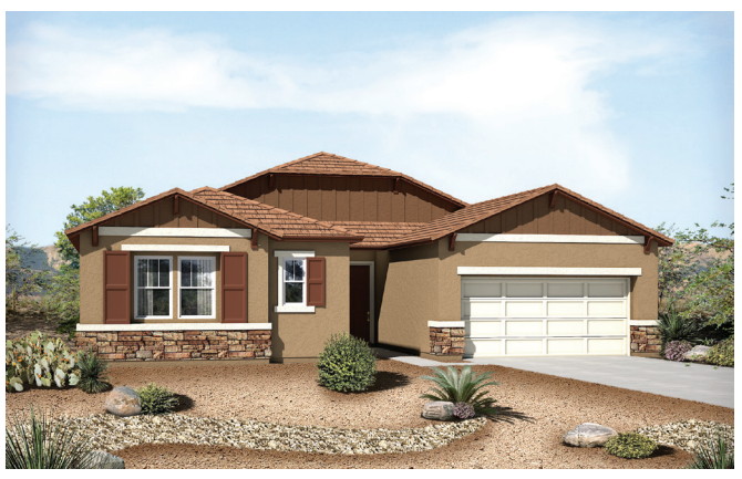
Elevation B - Shown with optional stone

From the comfortable study with optional French doors and built-in bookcase to the covered back patio, this charming ranch plan is the perfect place to relax at the end of a busy day. Enjoy a spacious great room with optional corner fireplace, a sunny kitchen with two walk-in pantries and an inviting breakfast nook overlooking the patio.