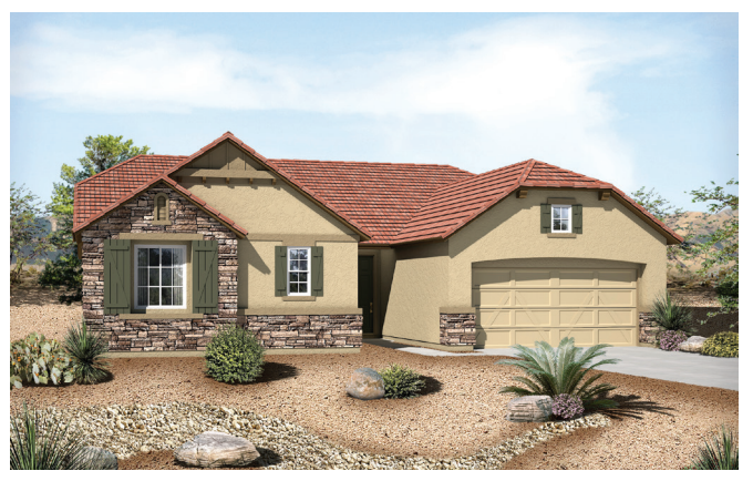
Elevation D - Shown with optional stone

HOME GALLERY 3091 West Ina Road Tucson, AZ 85741 877-346-8102