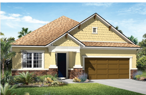
Elevation C Shown with optional stone