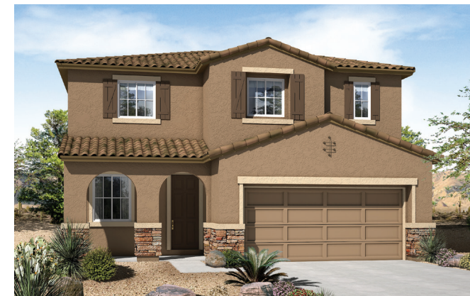
Elevation C shown with optional stone