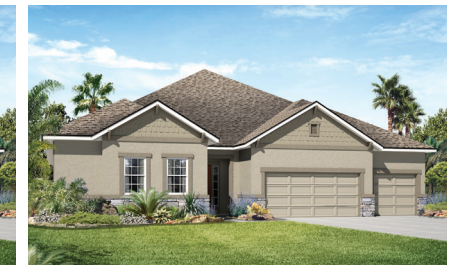
Elevation C - shown with optional stone