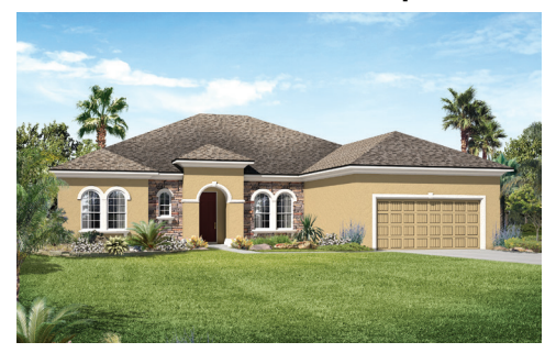
Elevation C - shown with opt. stone