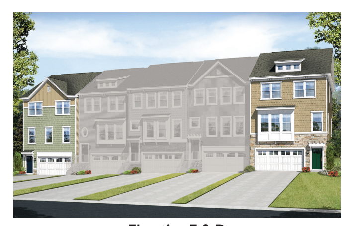
Elevation E & D