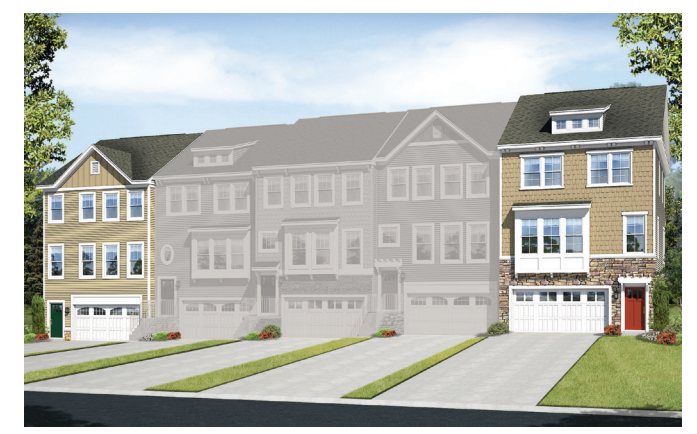
Elevation A & D