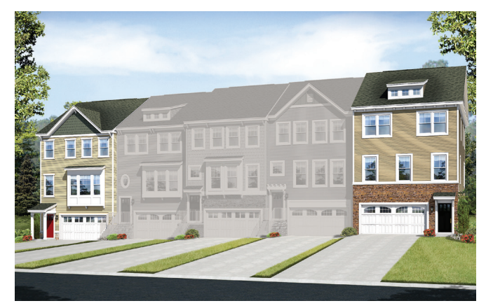
Elevation C & B

As you enter the Karen plan, you'll find a finished rec room and half bath off the 2-car garage. Upstairs, enjoy formal living and dining rooms that open onto a spacious kitchen with an island, pantry and nook. Inviting bedrooms, including a master bedroom with double doors, a private bath and walk-in closet, are located on the top floor. Options such a bonus bedroom, sunroom, gourmet kitchen and master sitting room are also available.