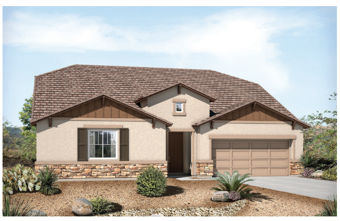
Elevation B - Shown with optional stone

The Paisley offers a large main-floor master bedroom with private bath and two additional bedrooms on the main floor. Also on the first level is a study and an open great room/kitchen combination. Upstairs, you'll find a spacious bonus room with private bath with options to convert the space into bedrooms and a loft.