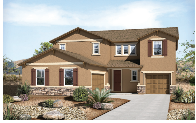
Elevation B - Shown with optional stone