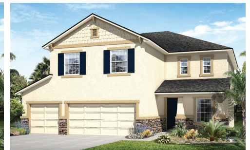
Elevation C - shown with optional stone