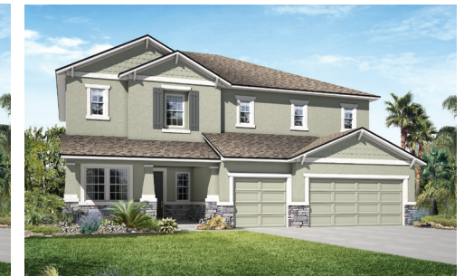
Elevation C - shown with opt. stone