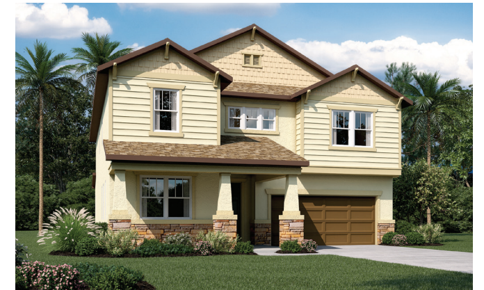
Elevation C - Shown with optional stone