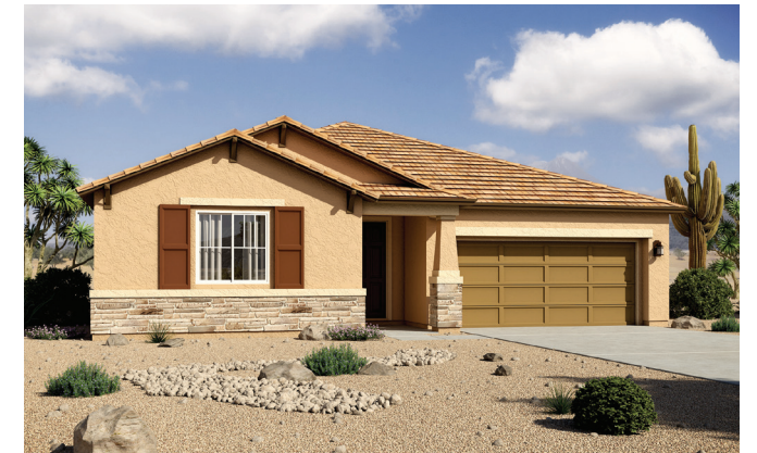
Elevation B Shown with optional stone