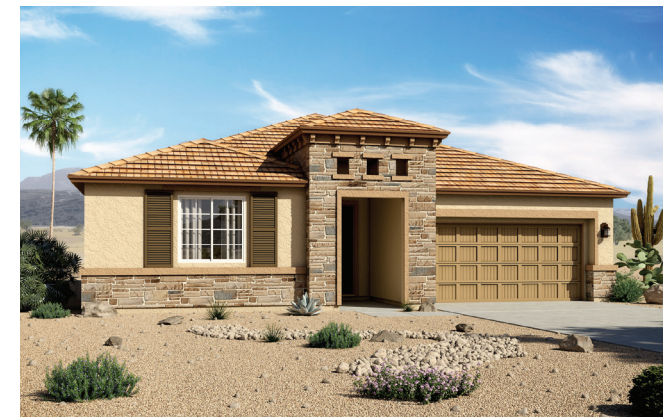
Elevation C Shown with optional stone