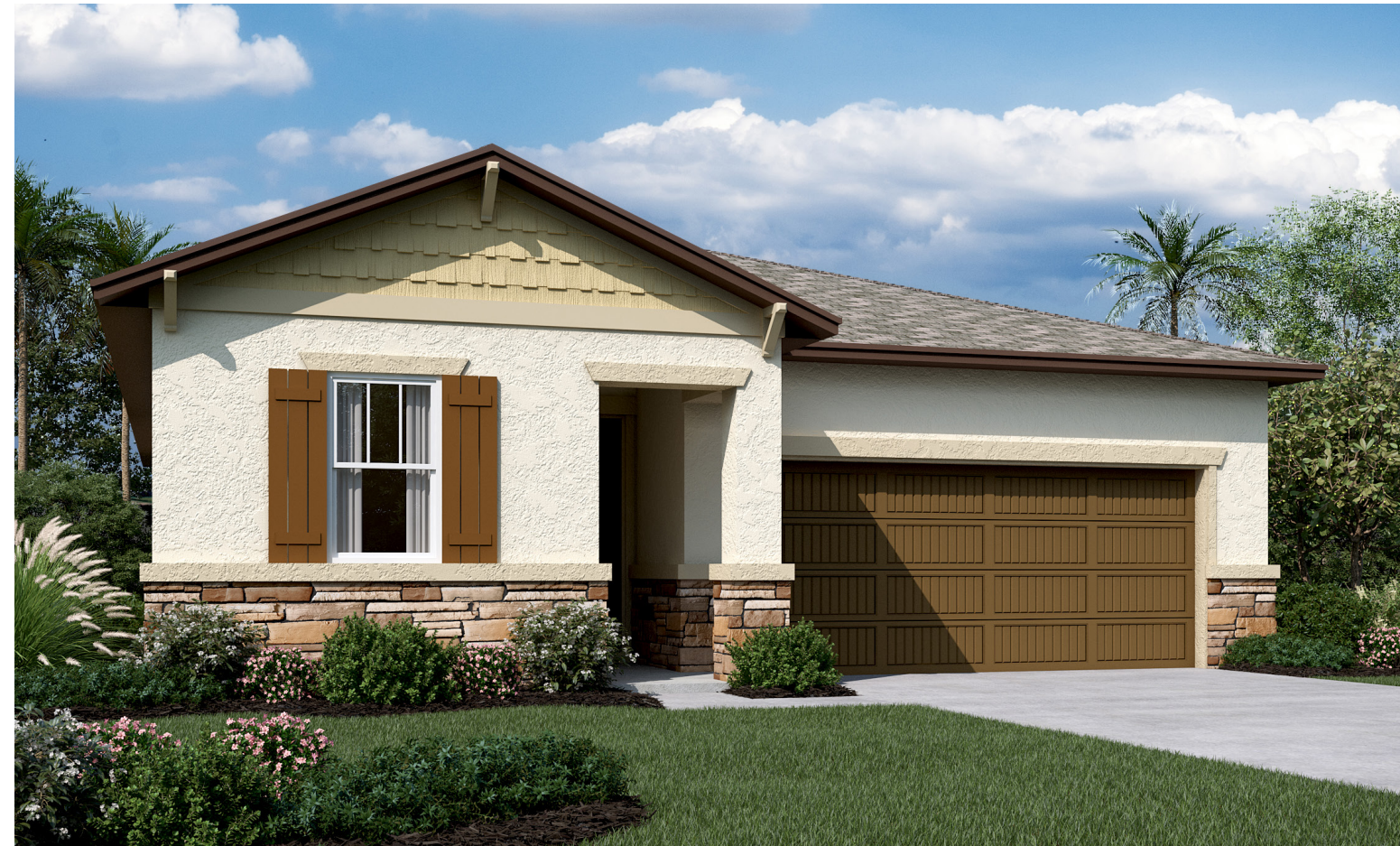
ELEVATION C - SHOWN W/ OPT. STONE

Approx. 1,700 sq. ft. | 1 story | 3 bedrooms | 2-car garage | Plan #FC10