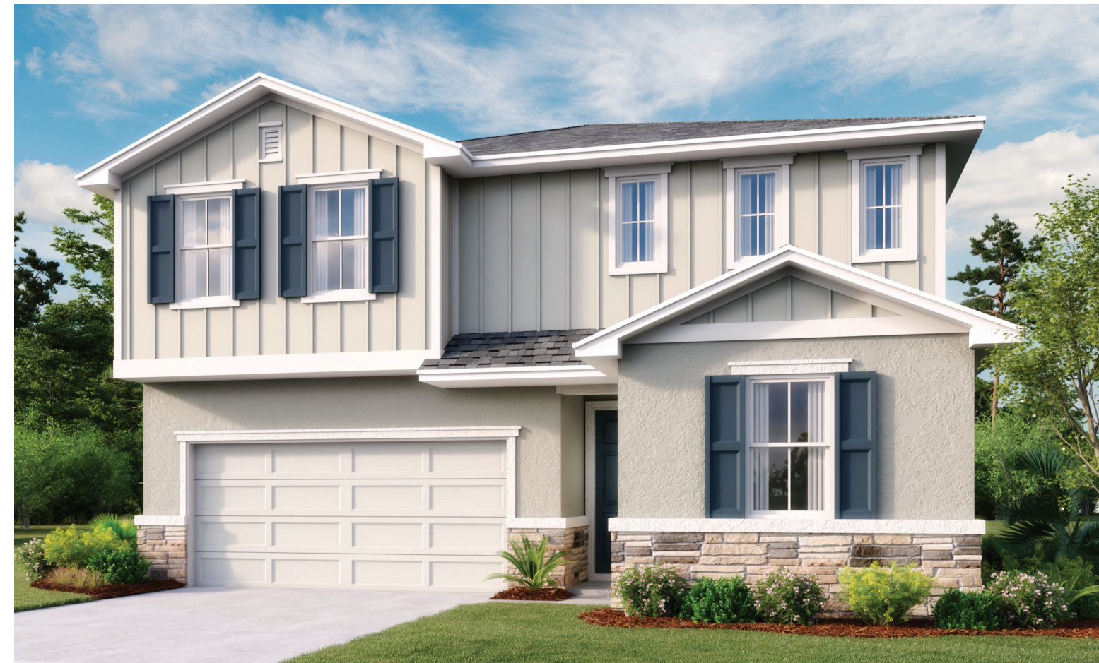
ELEVATION F - SHOWN W/ OPT STONE