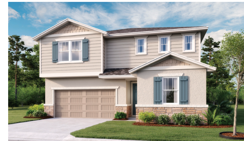
ELEVATION E - SHOWN W/ OPTIONAL STONE