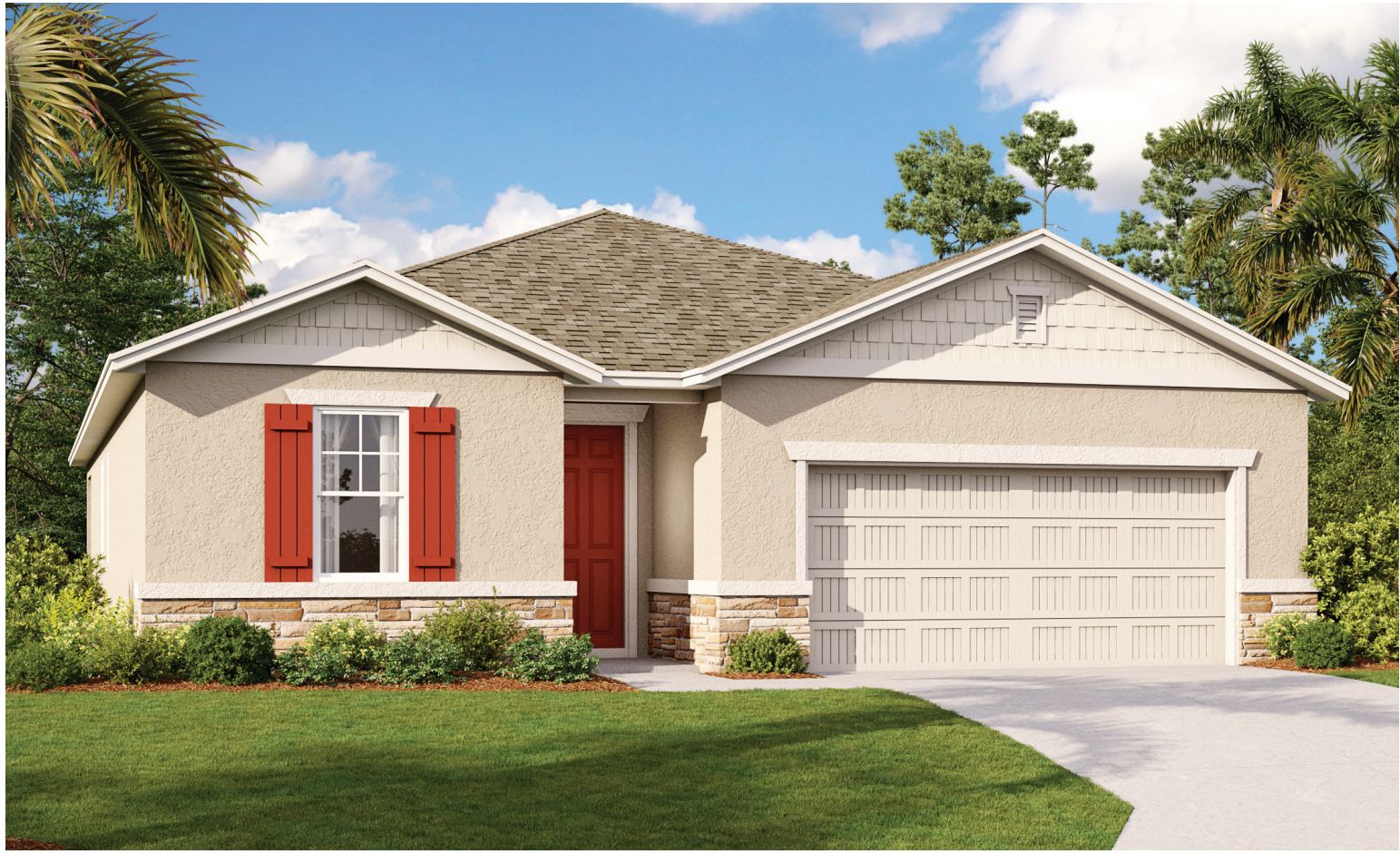
ELEVATION C - w/ Optional Stone