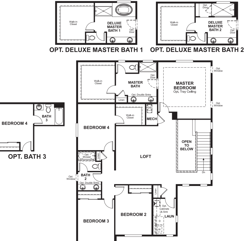
Walk-in Closet 10

Floor plans and renderings are conceptual drawings and may vary from actual plans and homes as built. Options and features may not be available on all homes and are subject to change without notice. Actual homes may vary from photos and/or drawings which show upgraded landscaping and may not represent the lowest-priced homes in the community. Features may include optional upgrades and may not be available on all homes. Square footage numbers are approximate and are subject to change without notice. Prices, specifications and availability subject to change without notice. ©2021 Richmond American Homes, Richmond American Homes of Colorado, Inc. 1/29/2021