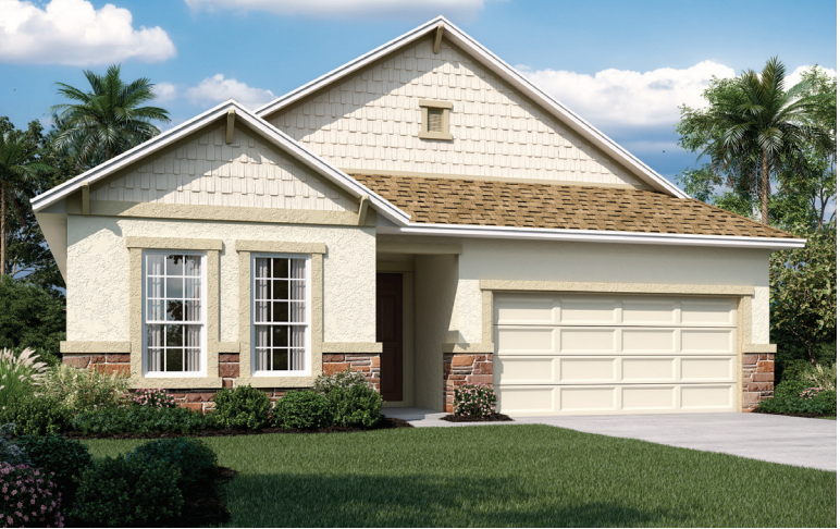
Elevation C Shown with optional stone

Approx. square feet: 2,450 Stories: 1 Bedrooms: 3 - 4 Garage: 2- to 3-car Plan Number: J29A