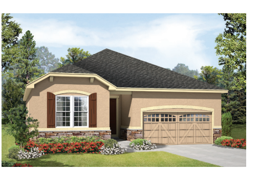
Elevation A Elevation B