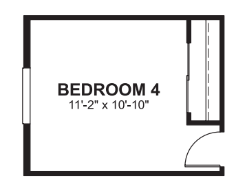
OPT. BEDROOM 4