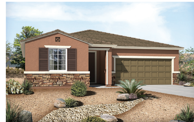
Elevation C - Shown with optional stone