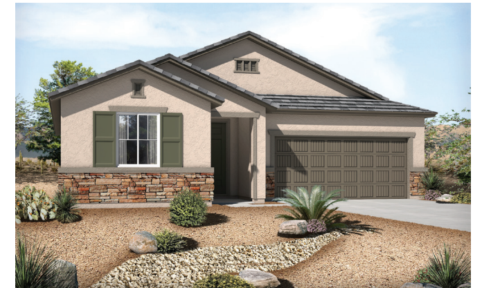
Elevation B - Shown with optional stone