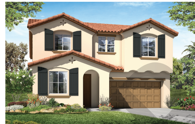
Elevation A - Spanish