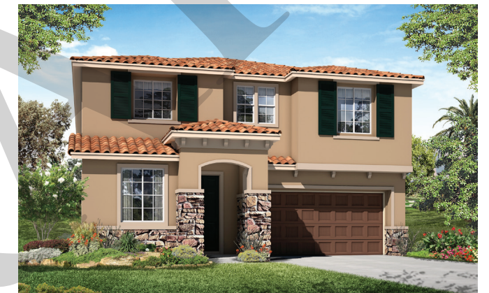
Elevation B - Italian