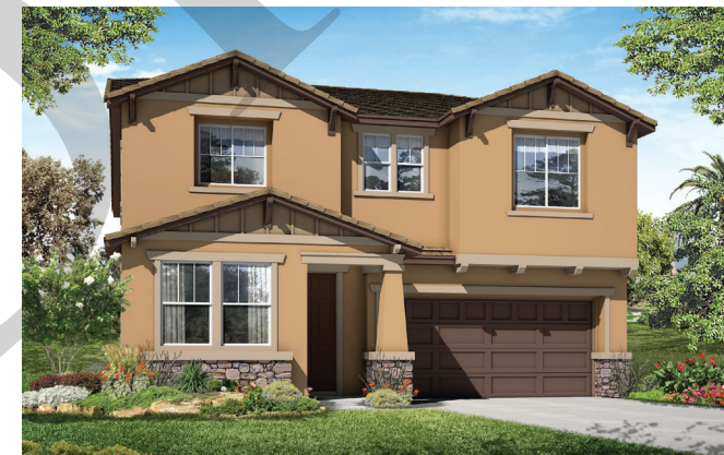
Elevation C - Craftsman