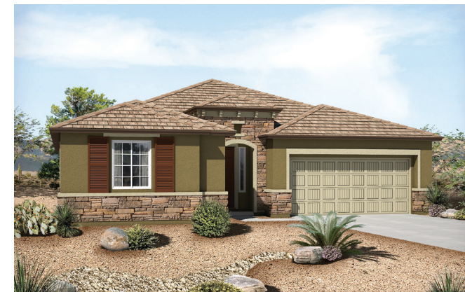
Elevation C - Shown with optional stone