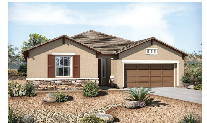
Elevation B - Shown with optional stone