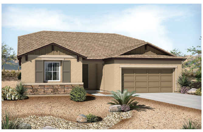
Elevation B - Shown with optional stone

The ranch-style Claudia provides inviting spaces to gather with friends and family. An immense great room and open kitchen with optional gourmet features provide a comfortable setting for casual groups. The master suite includes a private bath and walk-in closet, and the living room can be optioned as a study or formal dining room.