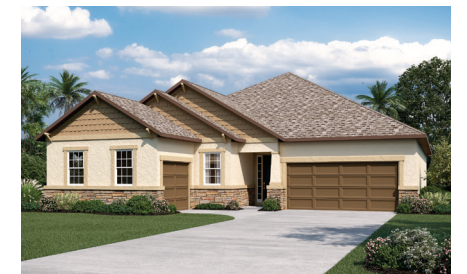
Elevation C - Shown w/ opt stone