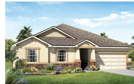
Elevation C - shown with stone