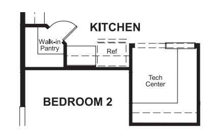
OPT. TECH CENTER