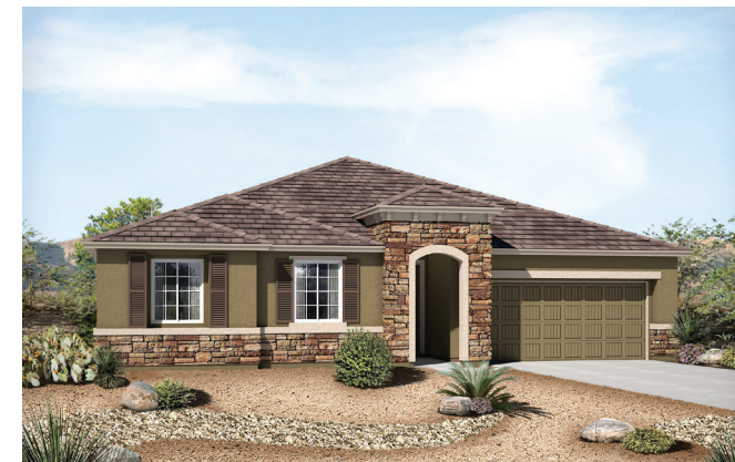
Elevation C - Shown with optional stone