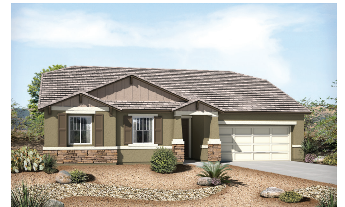
Elevation B - Shown with optional stone