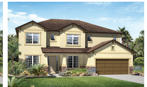
Elevation C - Shown w/ optional stone