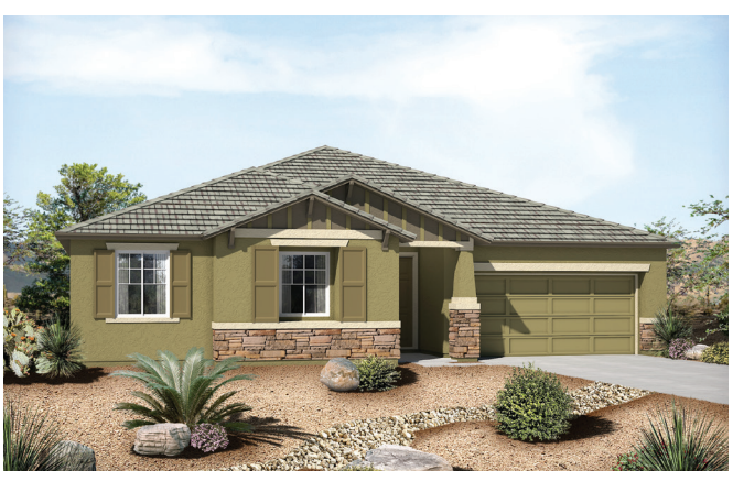
Elevation B - Shown with optional stone

The 3-bedroom Delaney ranch plan is designed with delight. Standard features include an expansive great room open to the charming corner kitchen and sunny breakfast nook, a secluded formal dining room and a private master bedroom with walk-in closet. Plus, you can choose to add a quiet study or a gourmet kitchen.