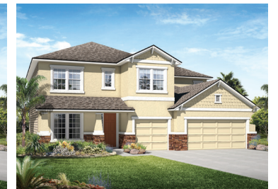
Elevation C - shown with optional stone