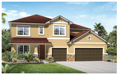
Elevation C - Shown w/ optional stone