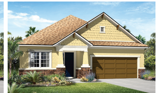
Elevation C Shown with optional stone