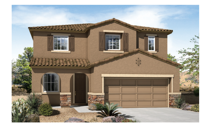
Elevation C shown with optional stone