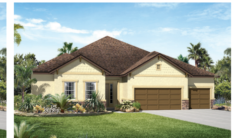
Elevation C - Shown w/Opt stone